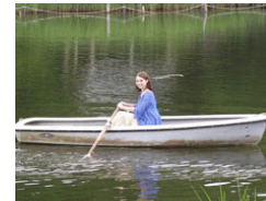
5x Optical Zoom