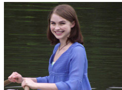
18x Optical Zoom